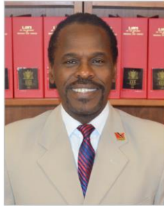
THE HONOURABLE FITZGERALD E. HINDS MINISTER IN THE MINISTRY OF THE ATTORNEY GENERAL AND LEGAL AFFAIRS

Wednesday, May 15, 2019 • 3pm-6pm • Hansraj Sumairsingh Multi-purpose Complex Dades Trace, Tabaquite Road, Rio Claro